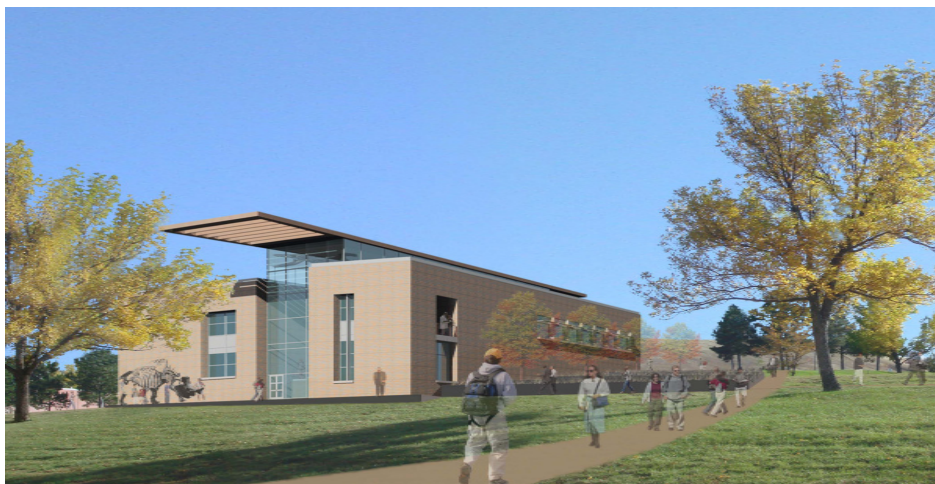
Rendering of proposed Paleontology building, viewed looking south

The year 2008 has been very busy for the paleontology department and Jim Martin. As reported last year, the paleontology building has received funding from the State of South Dakota. As a result, much of Jim's time has been expended in directing the effort to move the building ahead with interface with architects, state engineers, and preparing for the move of approximately 300,000 specimens. Currently, the architectural plans are completed, and bids for construction should be let in December and close in January, 2009. If all goes well, ground-breaking for the new facility will occur in March. Obviously, we are very excited and hope that the project will be completed by August, 2010, in spite of economic concerns. We will need to raise additional funds for outfitting laboratories, and particularly for storage carriages and drawers ($500,000). Overall, we hope to raise an additional $3 million to outfit the building and for specimen and archival storage. We could certainly use your help in any amount you are willing to give. Please contact James.Martin@sdsmt.edu if you are willing to contribute or have ideas for fund-raising.